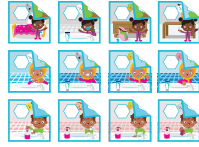
Blue Sequence Cards x3