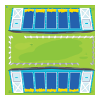
Blue Mat x3