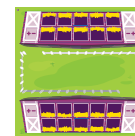
Purple Mat x3